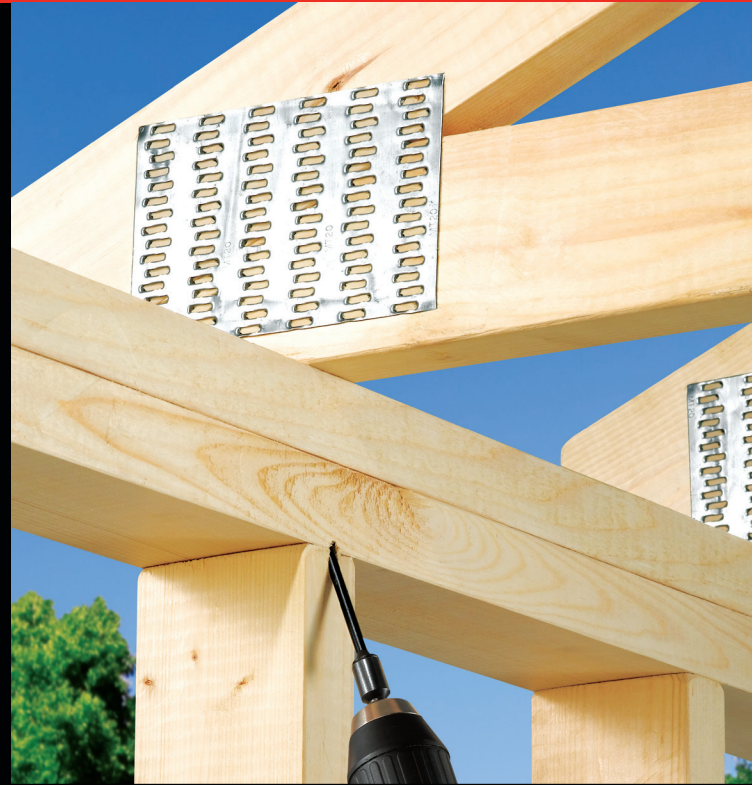
Rafter/Truss to Top Plate