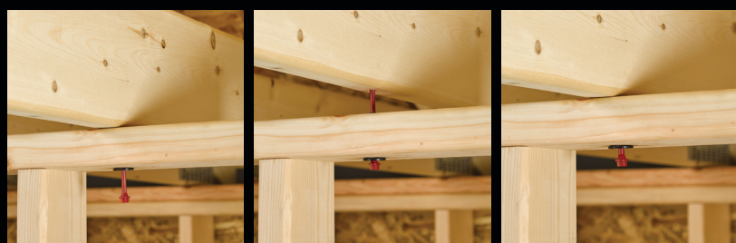
NLB movement during load transfer from above and below