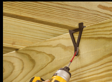
Deck Joist to Carrying Beam