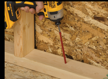
Wall Plate to Rim Board