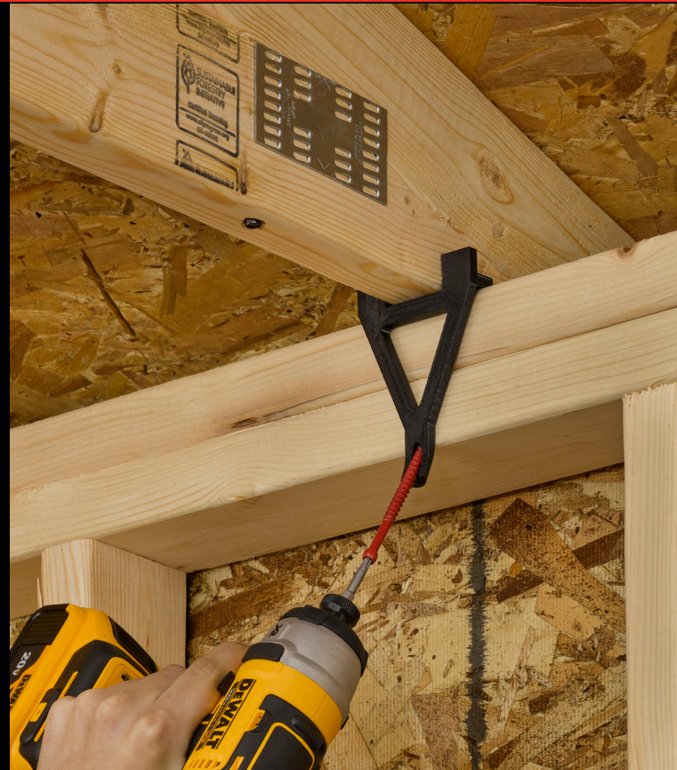
Roof Truss to Wall Plate

1 Based on side-by-side comparison using traditional hurricane tie for securing roof trusses to wall plate in a wood framed structure versus FrameFAST truss-to-top-plate connection. Time study information available at FastenMaster.com