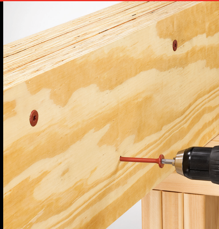
Multi-Ply LVL Beams