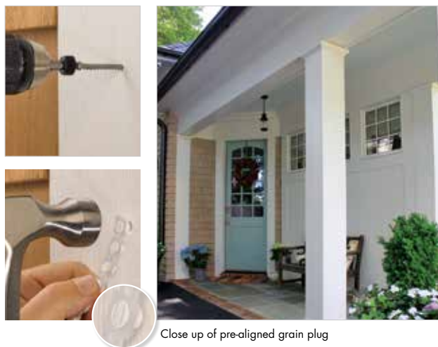
Close up of pre-aligned grain plug