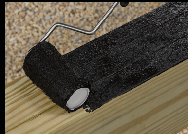
Deck Carrying Beams